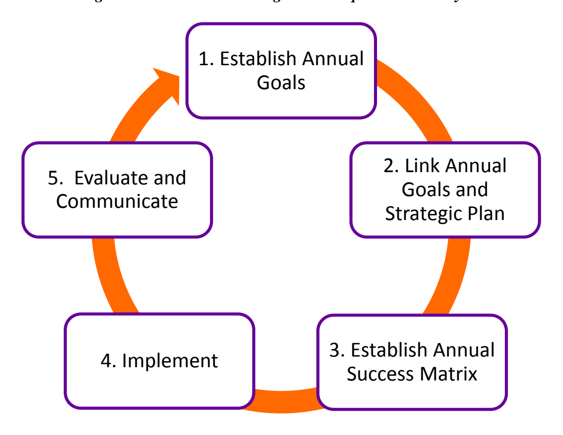
Figure 1. Continuous Strategic Plan Implementation Cycle