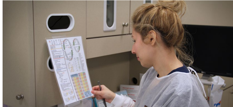
Here’s something to smile about: for two consecutive years, every dental hygiene program graduate passed the Commission on Dental Competency and Assessments licensing exam.

Sometimes, it’s the design itself that gets recognized. Literally! Last year, Bergen captured two National Council in Marketing and Public Relations Paragon Awards - the highest honor for excellence in strategic communication at community colleges - recognizing excellence in graphic design and editorial content for materials created by its in-house creative team.