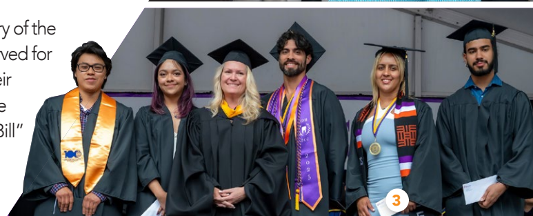
Spring 2025 Foundation scholarship awardees.