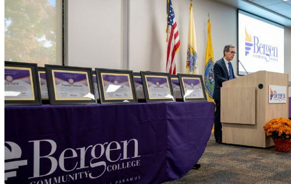
The College also celebrated excellence with the annual employee recognition program for those marking milestone years at Bergen.