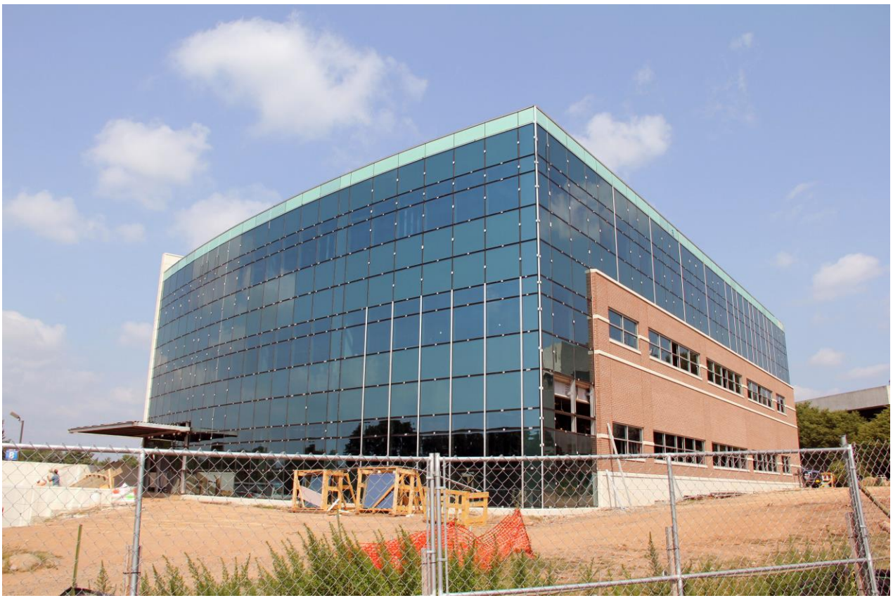
Health Professions Integrated Teaching Center Construction