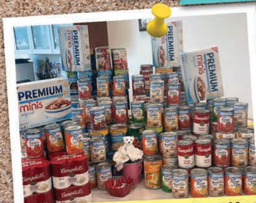
Nursing students collected more than 200 cans of soup for the Bergen Cares food pantry.