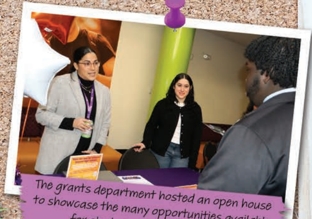
The grants department hosted an open house to showcase the many opportunities available for students, faculty and staff.