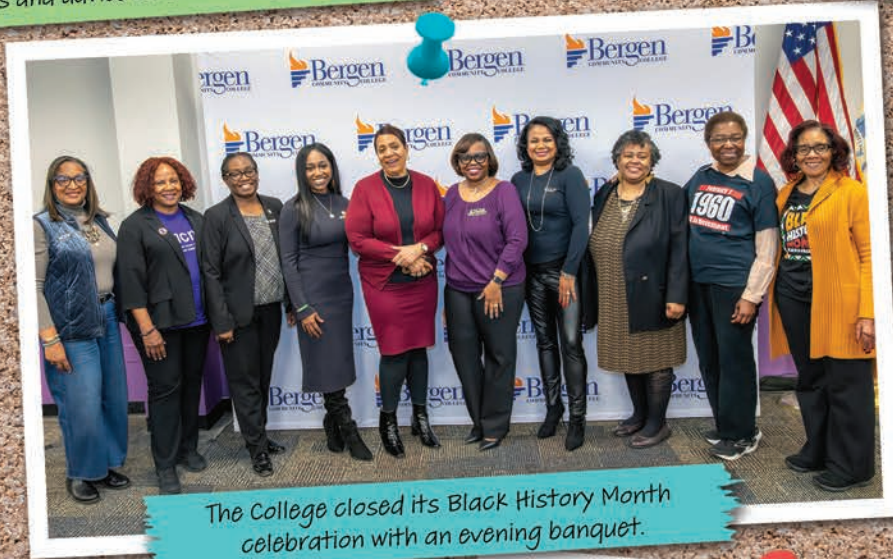
The College closed its Black History Month celebration with an evening banquet.