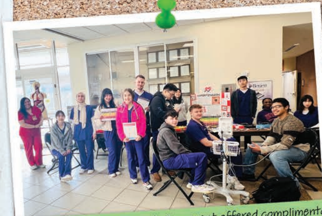
The "Heart 2 Heart" Valentine's Day event offered complimentary blood pressure checks and advice on circulatory health.