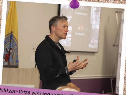
Pulitzer-Prize winning author Dr. Matthew Desmond provided the Keynote at the "Poverty in Our Communities Summit."