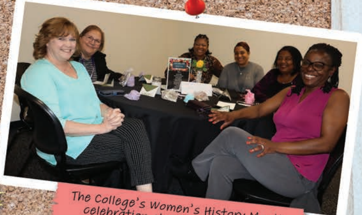
The College's Women's History Month celebration closed with a brunch.