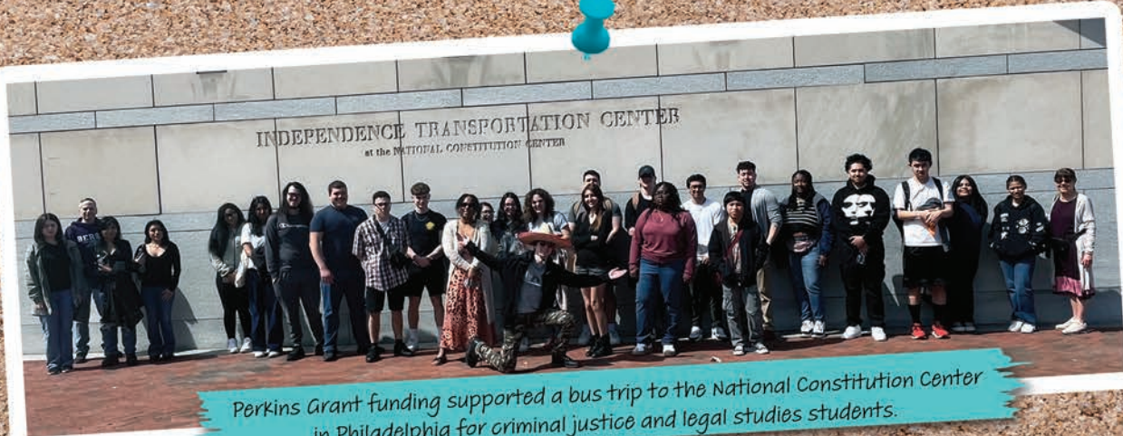
Perkins Grant funding supported a bus trip to the National Constitution Center in Philadelphia for criminal justice and legal studies students.