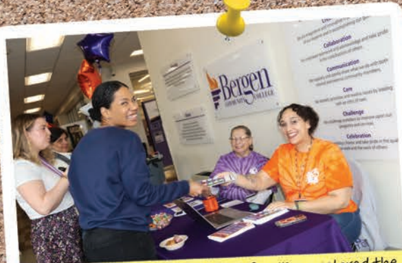
Prospective students and their families explored the main campus during the annual spring Open House.