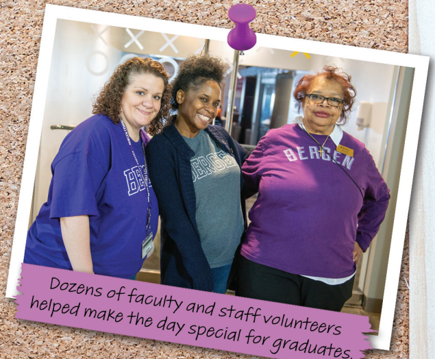
Dozens of faculty and staff volunteers helped make the day special for graduates.