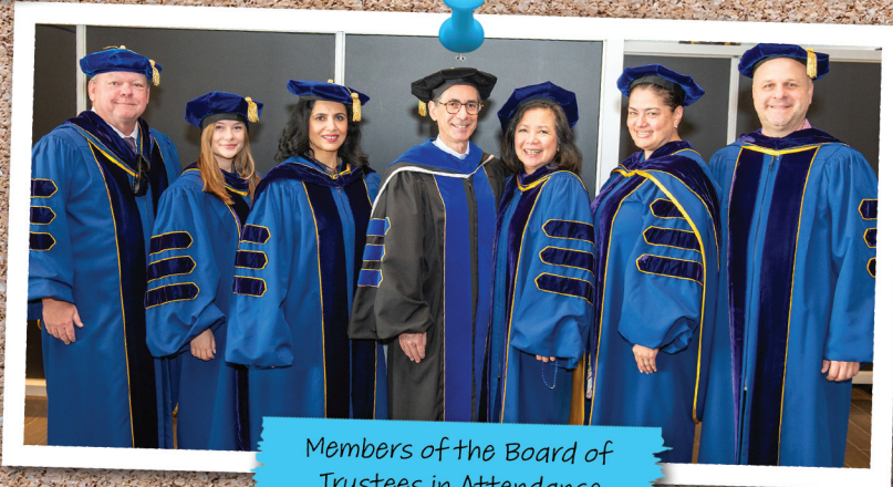
Members of the Board of Trustees in Attendance