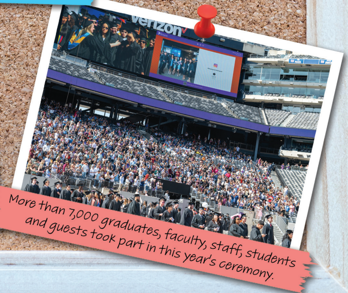
More than 7,000 graduates, faculty, staff, students and guests took part in this year's ceremony.