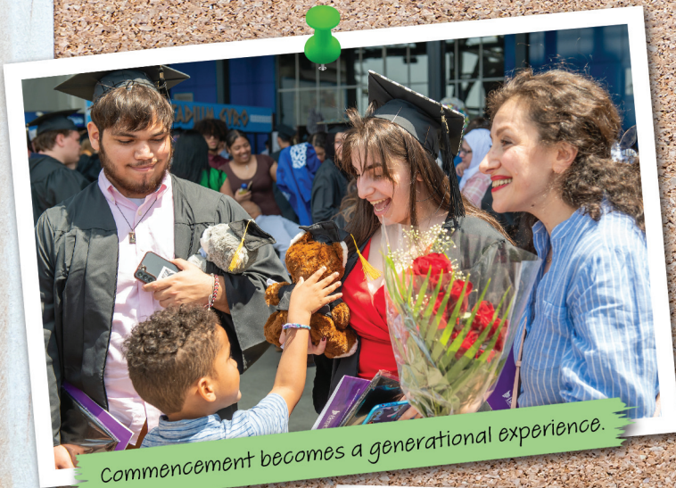
Commencement becomes a generational experience.