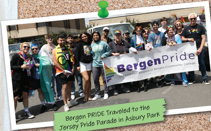
Bergen PRIDE Traveled to the Jersey Pride Parade in Asbury Park