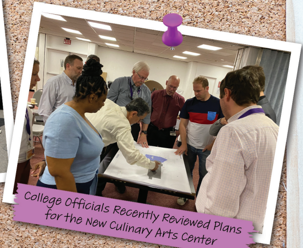
College Officials Recently Reviewed Plans for the New Culinary Arts Center