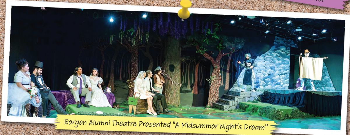
Bergen Alumni Theatre Presented "A Midsummer Night's Dream"