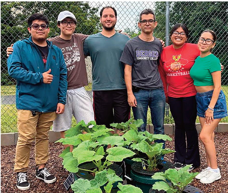
Bergen Community College students began tending to a hydroponic garden this summer.

CONNECT. NJ's most social community college. 60,000+ followers. Join the conversation.