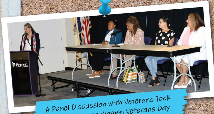
A Panel Discussion with Veterans Took Centerstage on Women Veterans Day