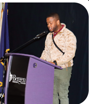
Black History Month