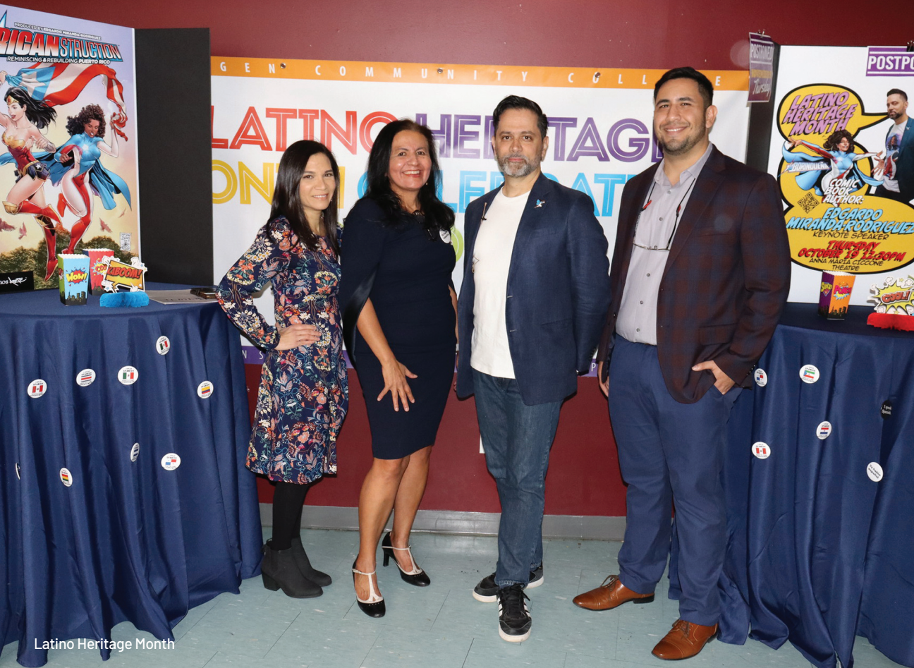
Latino Heritage Month