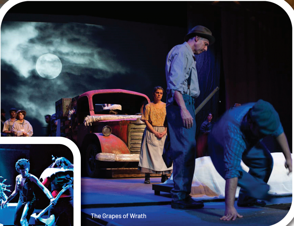
The Grapes of Wrath