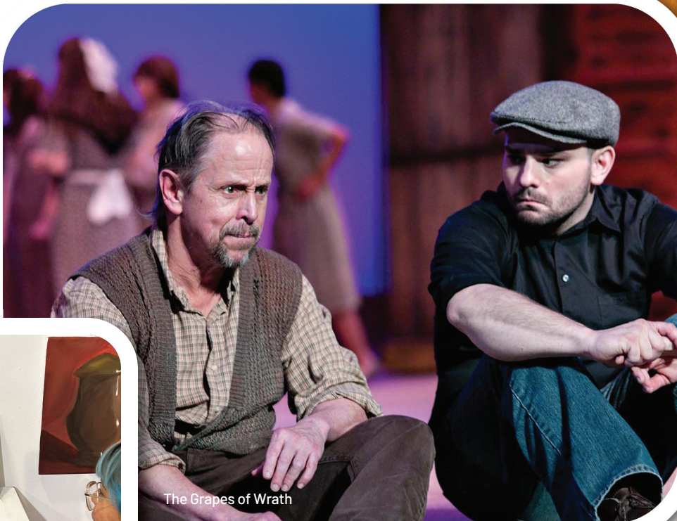
The Grapes of Wrath