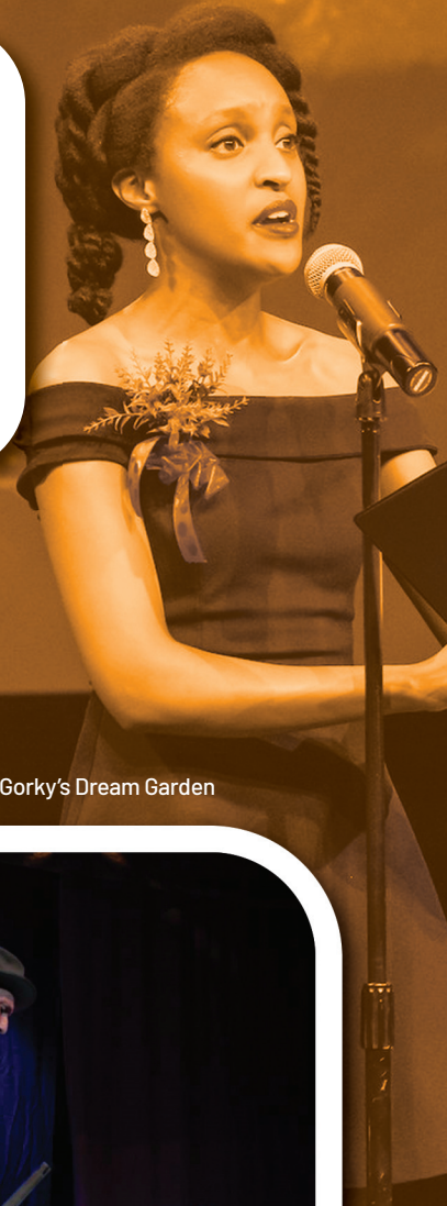
Gorky's Dream Garden