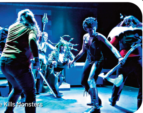
The Kills Monsters