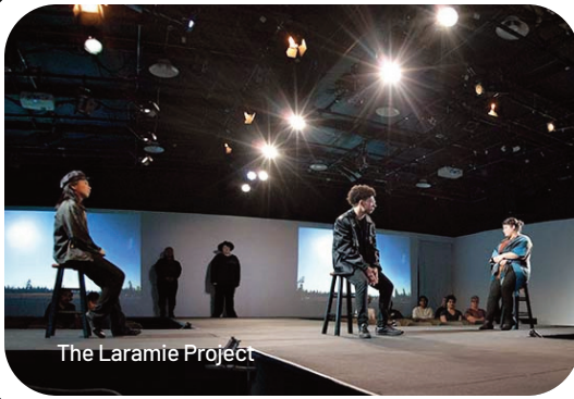
The Laramie Project