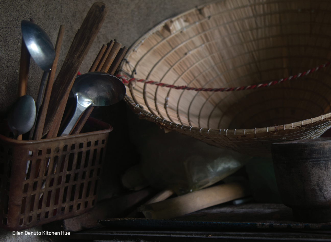
Ellen Denuto Kitchen Hue