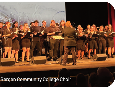
Bergen Community College Choir